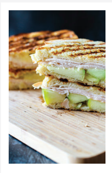
Sandwich or Wrap