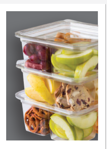
In Snack Packs