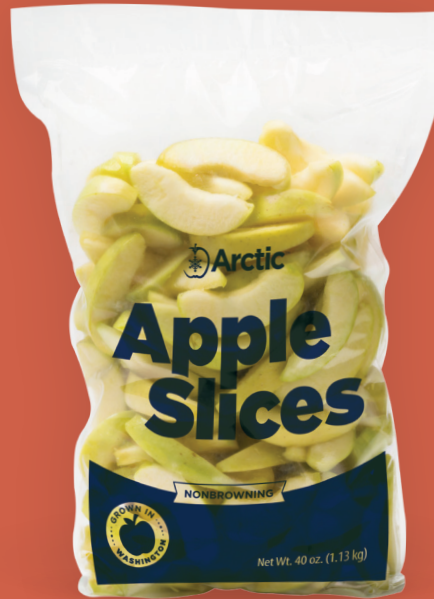
40 oz. packaging

The result? The distributor was able to grow both its relationships and its sales.